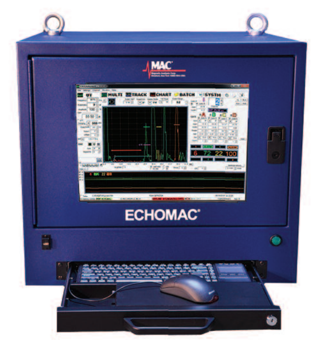
Echomac Instrument housed in a CAB 002 Environmental Cabinet