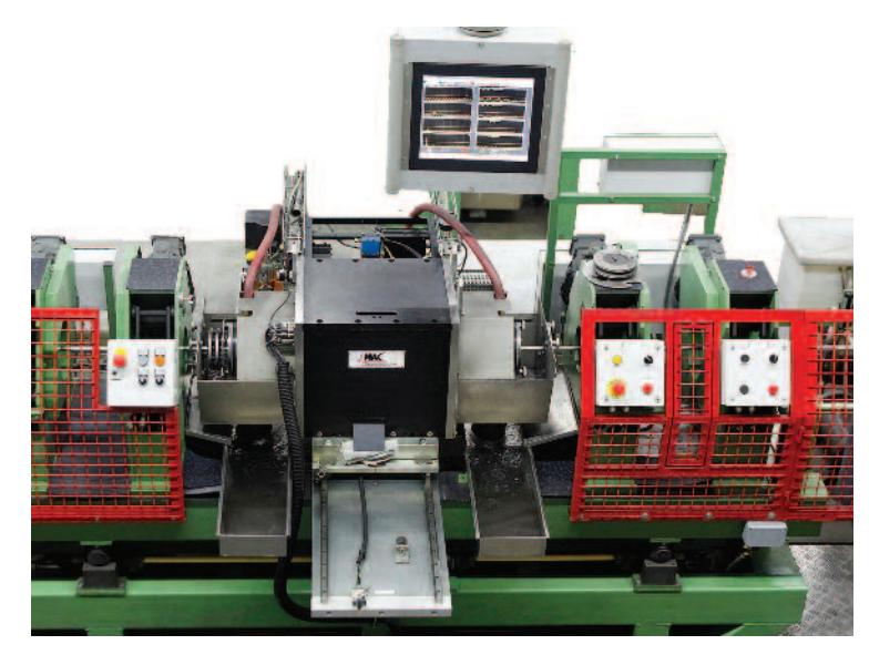
-Echomac® electronics installed with an Echomac® rotary transducer unit to test stainless steel and titanium alloy tube used in heat exchangers.