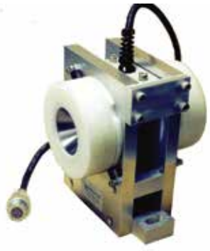
For an eddy current test, this coil platform houses the test coil. The platform includes built-in bushings on either side to stabilize the product and provide a constant center configuration during the test.