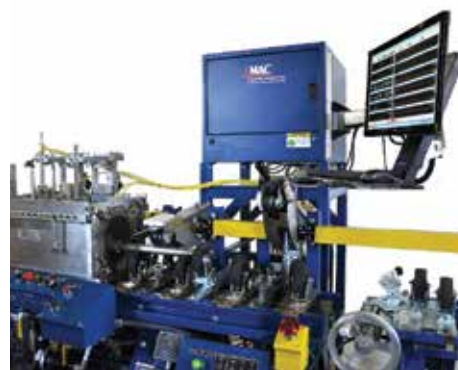
An ultrasonic test for titanium tubes uses a 'spin the product' type system to convey small diameter material through the test. Four UT test channels verify the OD and ID dimensions, eccentricity and ovality conditions, and two channels detect flaws.

Operator interface: This feature is generally overlooked. However, having an intuitive operator interface is extremely important. The better the interface, the quicker size changes can be made by the operator, which leads to an increase in productivity.