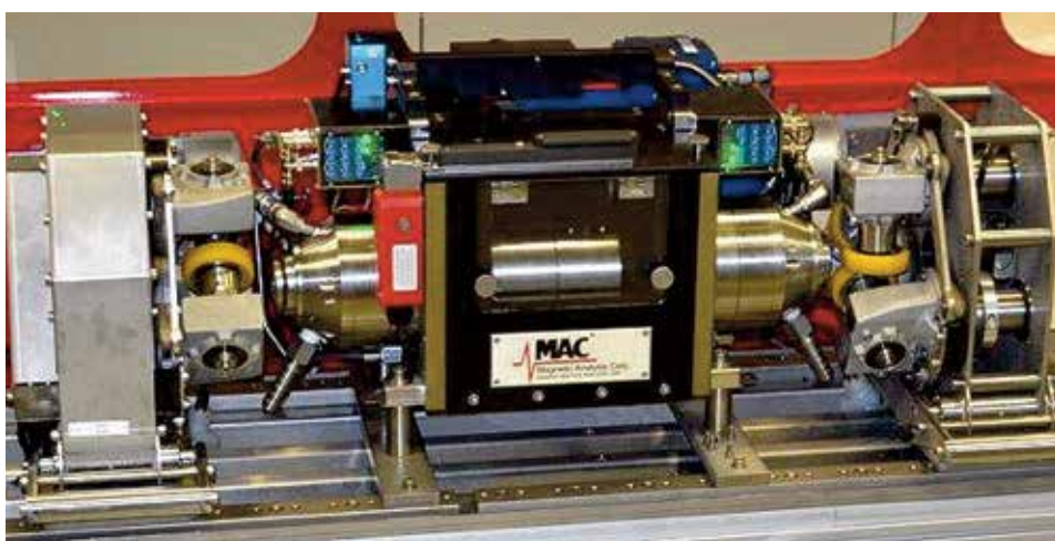
An ultrasonic test system using an Echomac® rotary is designed to inspect high-performance, small diameter stainless bars for medical component producers.

PHONE 973.361.4300 E-MAIL SALES@DOVERTUBULARALLOYS.COM FAX 973.361.0708