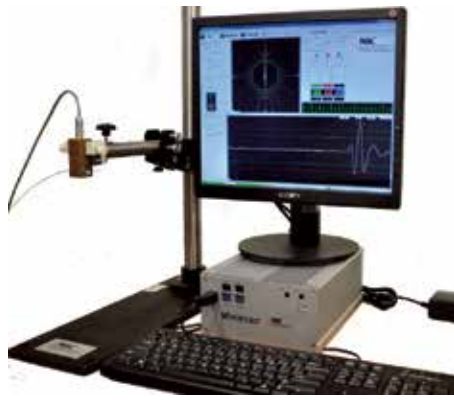
An eddy current test for ultra-small diameter wire detects short surface and subsurface cracks and welds using a Min-Imac® tester.