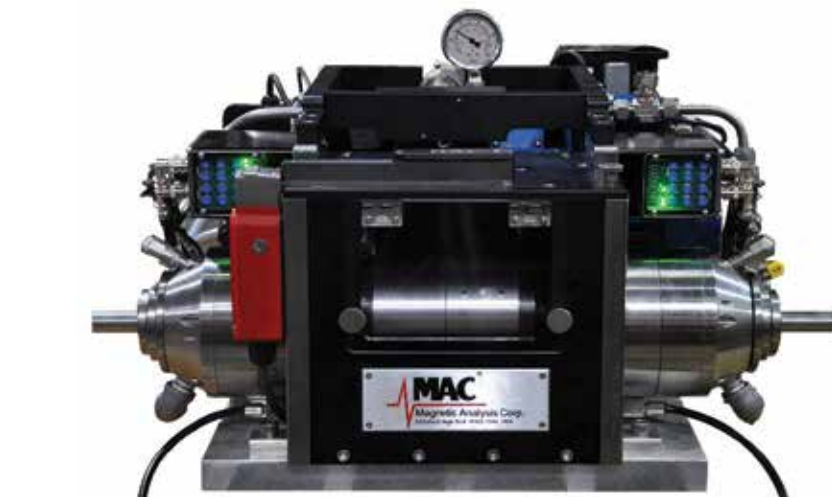
Ultrasonic transducers housed in the rotating water box of this Echomac® Ultrasonic Rotary provide high-speed flaw and dimensional inspection of 5 mm to 25 mm diameter material at high throughput rates.

This system gives users the ability to inspect a large range of diameters with the same unit, resulting in a lower cost inspection system, and a set-up time of approximately 20 minutes. Set-up includes manipulating the transducers and changing the