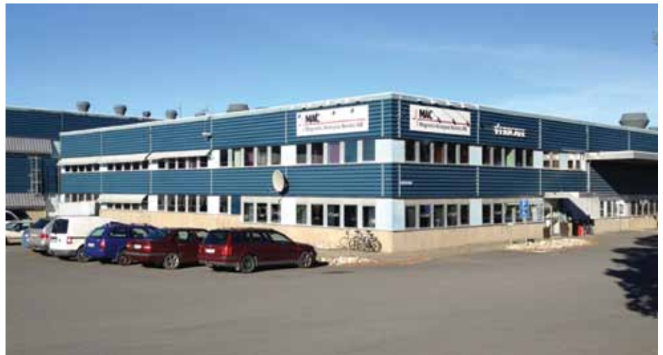
Magnetic Analysis Nordic's plant in Östersund, Sweden is one of MAC's three manufacturing plants.