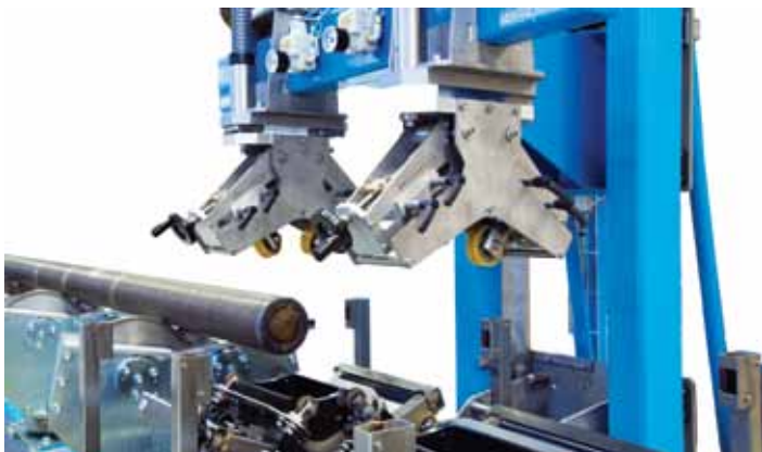
Ultrasonic APC (Automatic Pitch Control) test heads are raised up beneath a spinning tube as it passes through the test system. The upper elements lower onto the tube to maintain its position during the test.

of test coils that have been designed over the years for specific applications. Many have been developed as a direct solution to a client's specific problem and are now available to all customers who may need it. MAC prides itself on being able to develop products as a result of a specific client's request. Through this