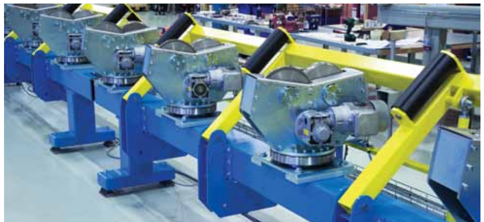
A custom designed helical spinning conveyor system ensures accuracy as tubes are fed into MAC's new APC (Automatic Pitch Control) full body ultrasonic tube tester.

wherever they have other plants. So that's a huge benefit we are proud to offer our customers. In terms of global competitors, a lot of our competition in places like India and China are solely local businesses and they sell their products at a very low price because of their location. But they don't offer the quality of product we do. When a steel company is selling their product locally, often the requirements of testing are not specified. However, a lot of these companies want to sell into international markets and to do that they need to have testing equipment that is recognized internationally. Their customers recognize that if they want to go global themselves, they need a global partner. MAC is that global partner.”