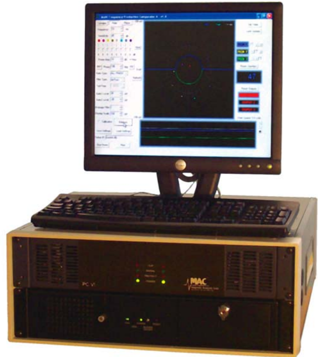
Multi Frequency Polar display includes chord and all phase thresholds. Strip chart linear format display is at bottom of the screen.

Features include a monitor presentation that provides simultaneous display of the "standard" piece and test piece wave forms for easy comparison. Test parameters, including filter, sensitivity, index gate and visible threshold levels, are selected using the keyboard or mouse while observing the effects on the display monitor. All functions and test setup parameters in software can also be accessed through a computer LAN network. Unlimited test setups can be stored on the hard drive for easy