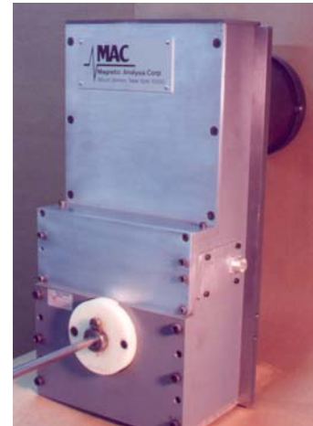
150 Rotary Mechanism