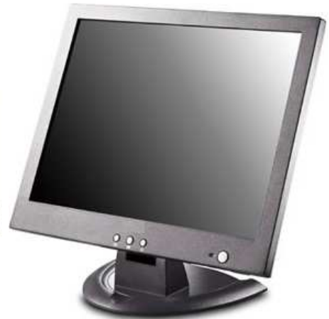
MON 015- 15.1" TFT with stand