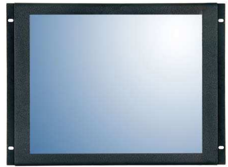
MON 202- 20" LCD TFT with stand