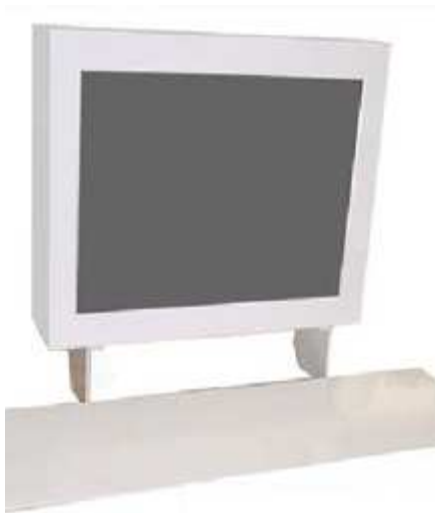
MON 017- 17" LCD with keyboard