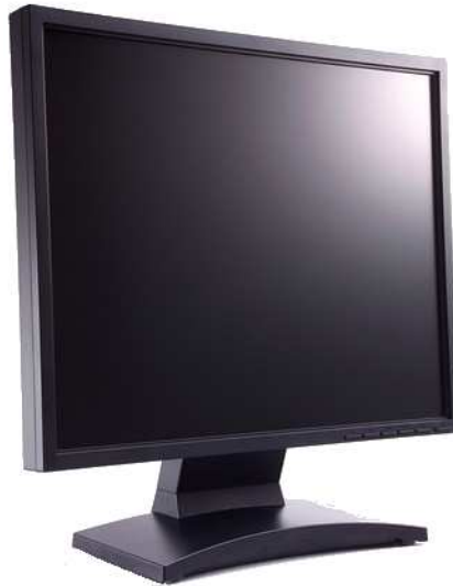
MON 005- 19" LCD with stand