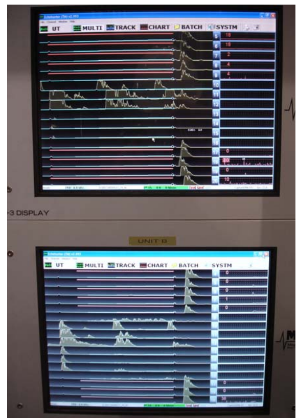
Echomac® FD-4 Display of 32 Channels

The system includes Echomac® FD-4 ultrasonic instrumentation integrated with mechanics, transducers, bubblers and controls manufactured for Magnetic Analysis Corp. by Reliant Technologies Inc. The windows XP based FD-4 provides ease of use with a point and click interface. Setups are easily stored and recalled for all round and billet sizes. Up to 64 channels are available to meet the most demanding speed and inspection coverage requirements.