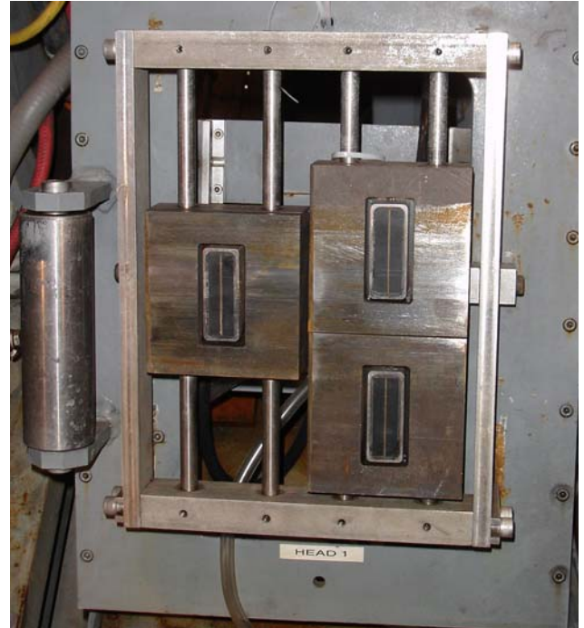
Test Head in Billet Testing Configuration