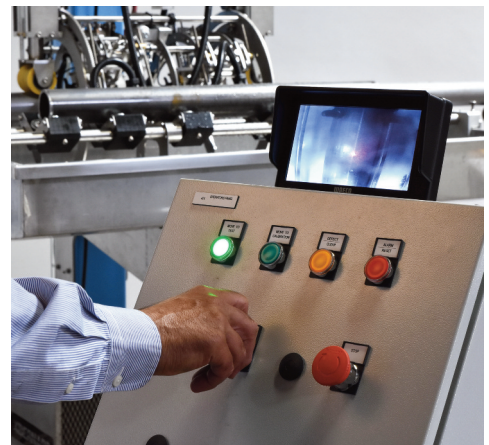
The remote operator station contains essential controls including the video monitor for checking transducer positioning with respect to the weld-zone, and the “joystick” for making adjustments.